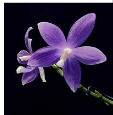
Phal. speciosa 'Blue Mountain' FCC/AOS