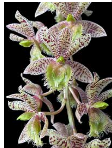
Clowesetum Joy Prout AM/AOS