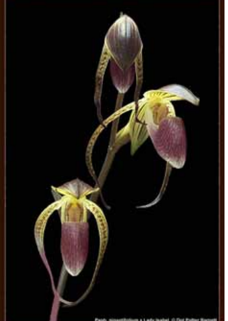
Peph, pipertholium a Lady leaded © Dot Potter Barret