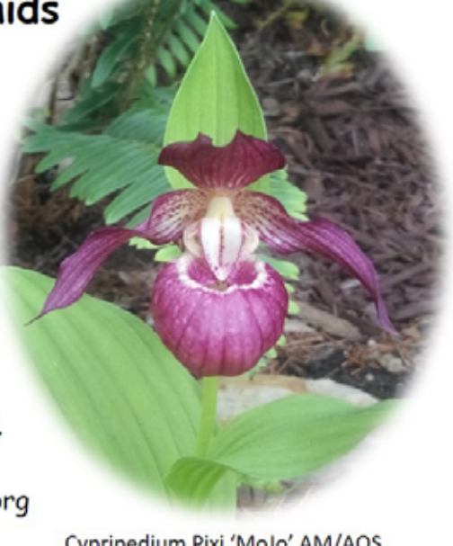
Cypripedium Pixi 'MoJo' AM/AOS

Location, times, costs, topics and daily schedule at www.gljc.org