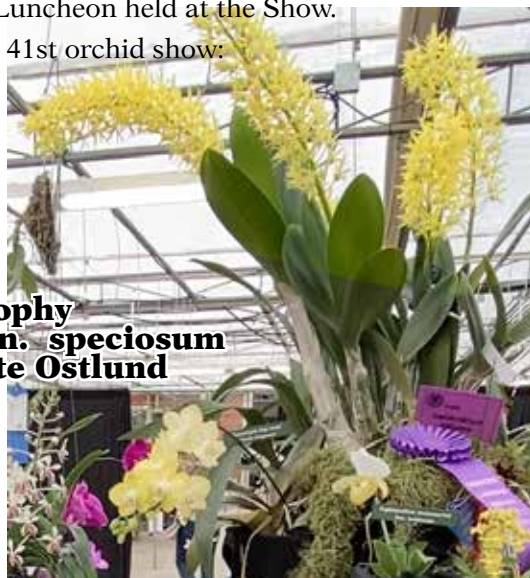
Trophy Den. speciosum Pete Ostlund