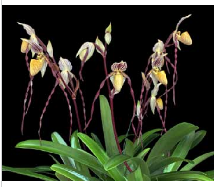
Paph. philippinense 'Wacousta'