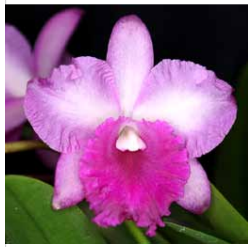
Rhyntonleya Raspberry Lemonade

Photos courtesy of Ed Cott, not to be used without the express permission of the photographer.