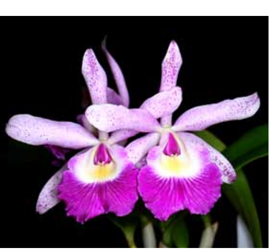
Brassocattleya Glorious May