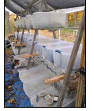
In these tubs are growing 200 moss logs that I sell to the terrarium people.

An example of one of the moss logs . Most of them can be kept outside year-round but my tropical mosses I keep in a separate greenhouse.