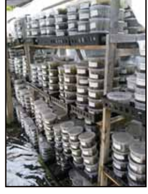
Here are cups of individual named moss species for terrarium use

An example of one of the moss logs . Most of them can be kept outside year-round but my tropical mosses I keep in a separate greenhouse.