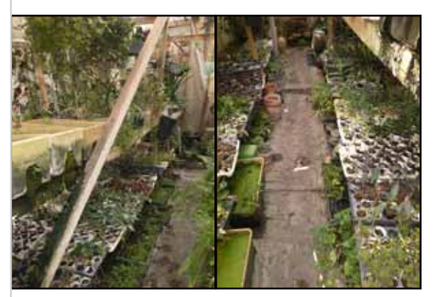
When you pay the heating bill, you use every square foot of growing space. I sell terrarium plants on eBay to pay for my orchid fix.

heat and light and left alone. I pot hanging baskets in shredded tire crumb so I never have to repot, at least for Cattleyas.