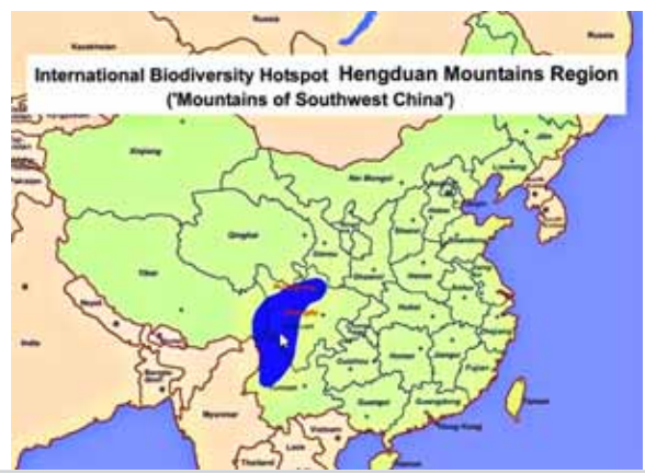
Dot's screenshots of presentation