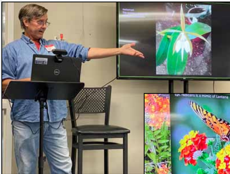
Dot's screenshots of presentation