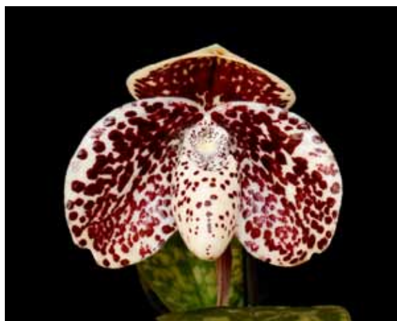
Paph bellatulum 'Littlefrog Super Spot' AM_AOS (84 pts)