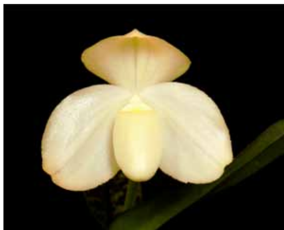
Paph Quantum Angels 'Littlefrog Yellow Angels' HCC_AOS (76 pts)