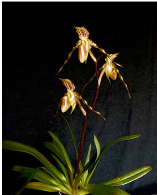
Paph Wilhelminiae 'Littlefrog Patience' AM_AOS (85 points)