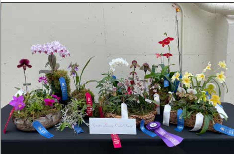
GLOS display at TROS